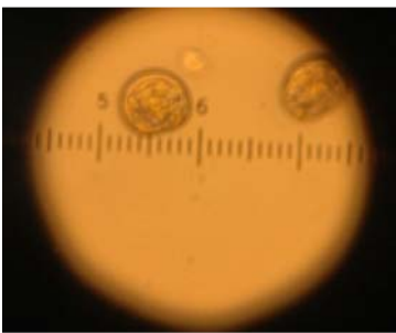
Oyster larvae under magnification