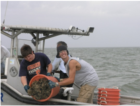
Oyster planting on restoration site