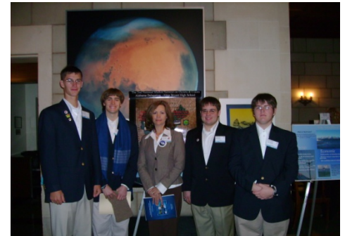
Students presenting Oyster Gardening work in Washington D.C.