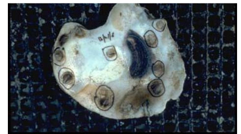
Oyster Spat on whole shell

To join, and help grow the education and restoration opportunities of The Mobile Bay Oyster Gardening Program, Contact P.J. Waters 251.438.5690 ( waterph@aces.edu ) Auburn University Marine Extension and Research Center