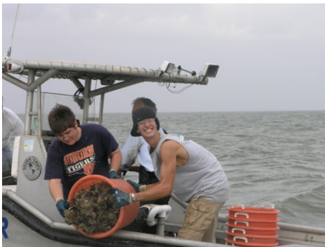
Oyster planting on restoration site