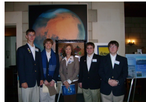
Students presenting Oyster Gardening work in Washington D.C.