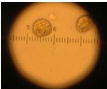
Oyster larvae under magnification